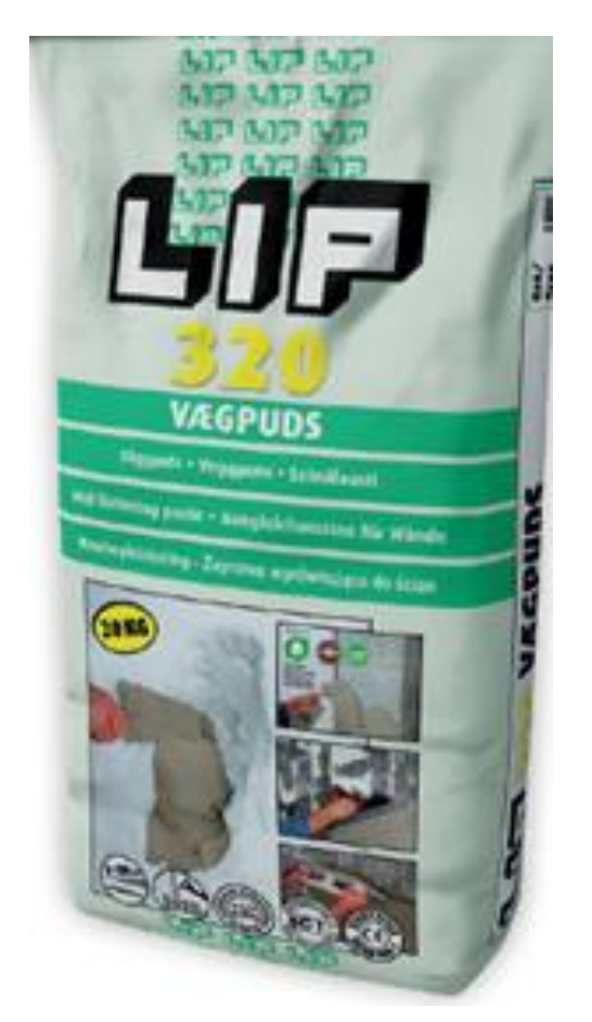
Figure 1: Pictures of the LIP product covered in this project report.

LIP 320 Wall Plaster and LIP 320E Wall Plaster.