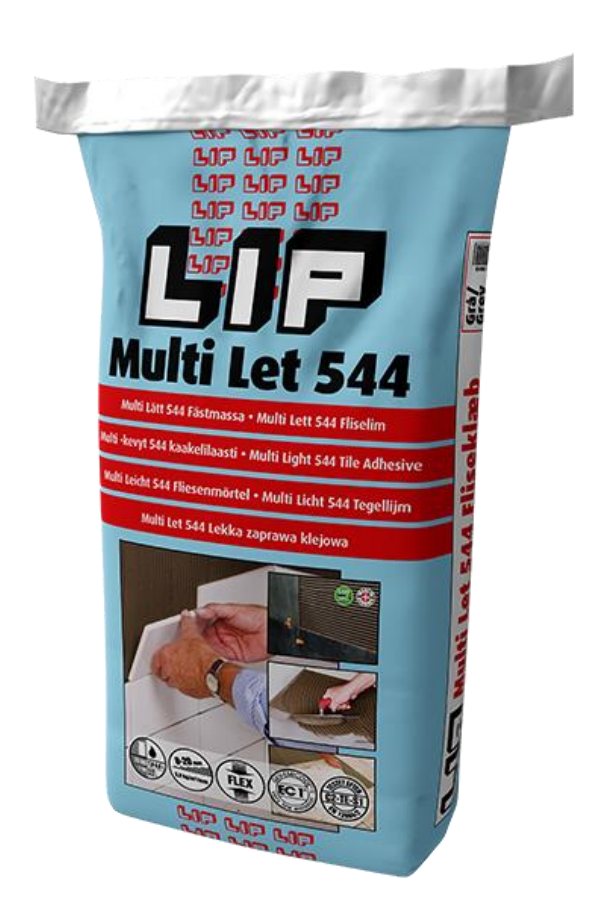
Figure 1: Pictures of the LIP product covered in this project report.